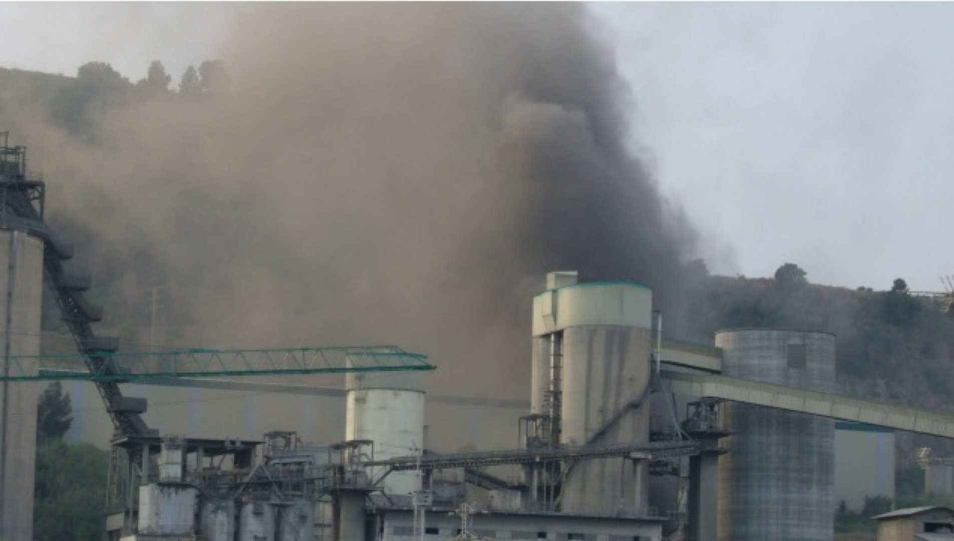
Cement factory burning in Montcada